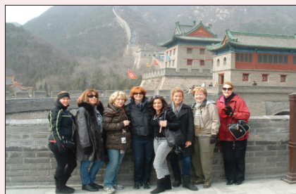
China next trip Oct 2011

Our new fav ultra light luggage: IT-01 The 25 inch bag weighs 5.5 Lbs and a carry-on only 3lbs. No more struggling. Great colors also, so you recognize your bag from afar. For those of you going to Africa, try RIT clothes sun block . You wash your clothes with it, to block them for months. A final favorite: The Swiss Card -like a credit card with finely honed tools