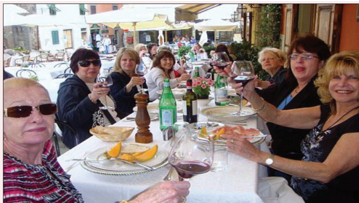
No whining with wine. Join us on one of our 2 upcoming Italy groups.

Receiving this email and not sure you are still a member? Call our office for an update 800-480-4448.